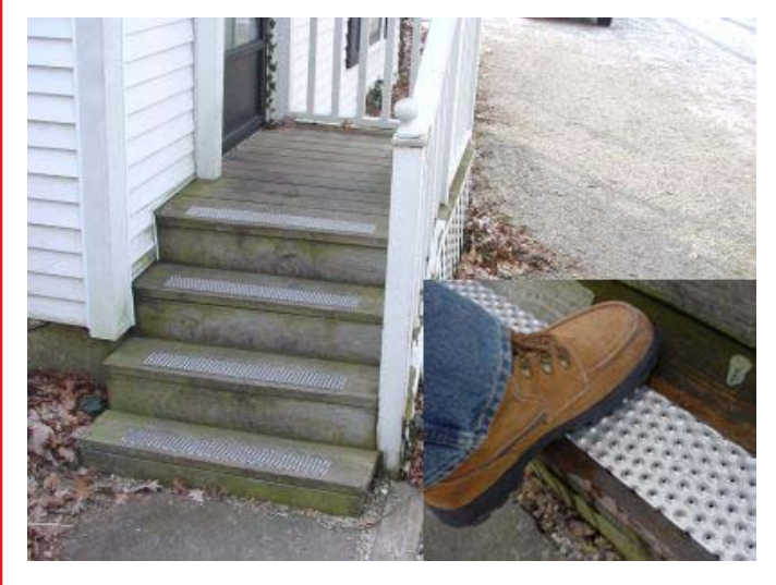
Non-Skid Stair & Deck Covering Safety Tread Strips

Heavy-Duty Non-Slip Surface Designed to Last a Lifetime